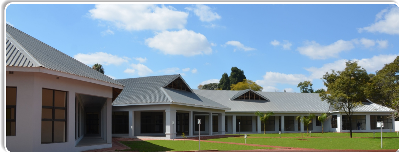
Harare Head office